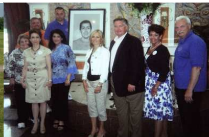
The Board of Directors gather at the Awards reception at Russo's on the Bay

Be a Part of Frankie's Mission! Get Involved! Host Your Own Charity Event to Benefit Our Cause!