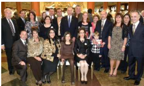
Board of Directors, Honorary Members, and Honorees for the afternoon gather together.